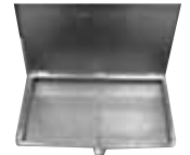
Waste Oil Filling Pan