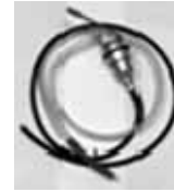
Waste Oil Hand Pump