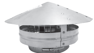
Stainless Steel Rain Cap