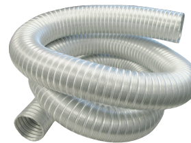
Stainless Steel Chimney Liner (25')