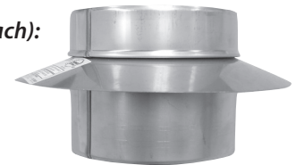
Stainless Steel Liner Support Collar