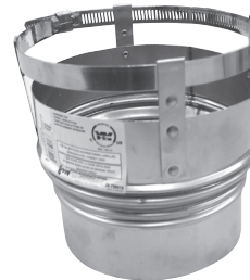
Stainless Steel Dripless Connector

Stainless Steel Liner Kit Assembly includes (1 each):